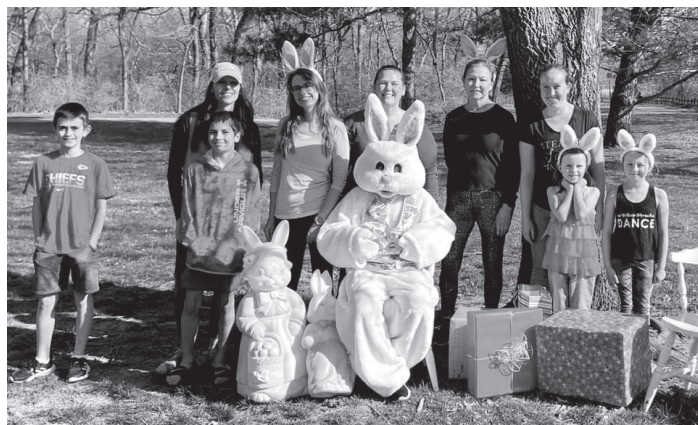
Social Committee volunteers at the Easter Egg Hunt, April 3.